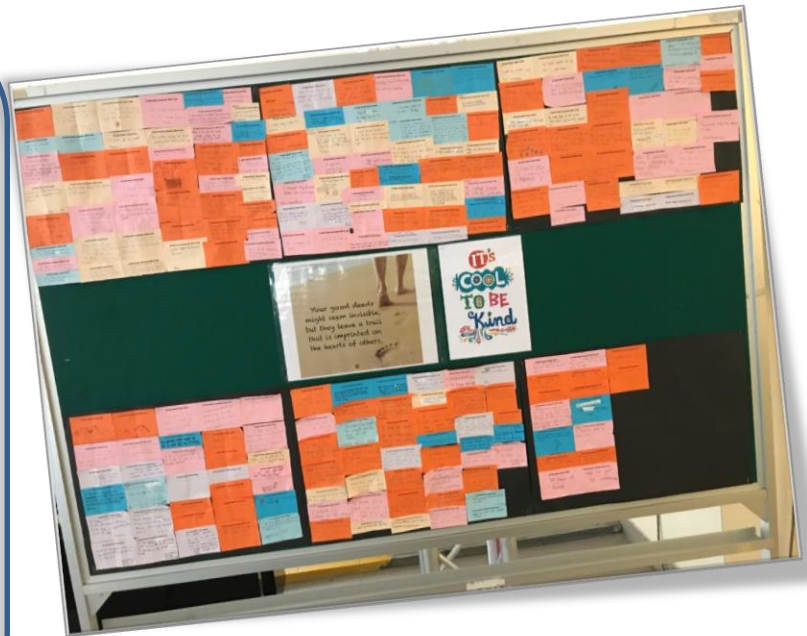
These notes were used as a photo montage during the Easter Play.

A box was placed on the Pastoral Notice Board for them to drop in their notes of kind deeds. These were subsequently gathered and pinned up on a moveable board which was placed in the canteen to encourage others.