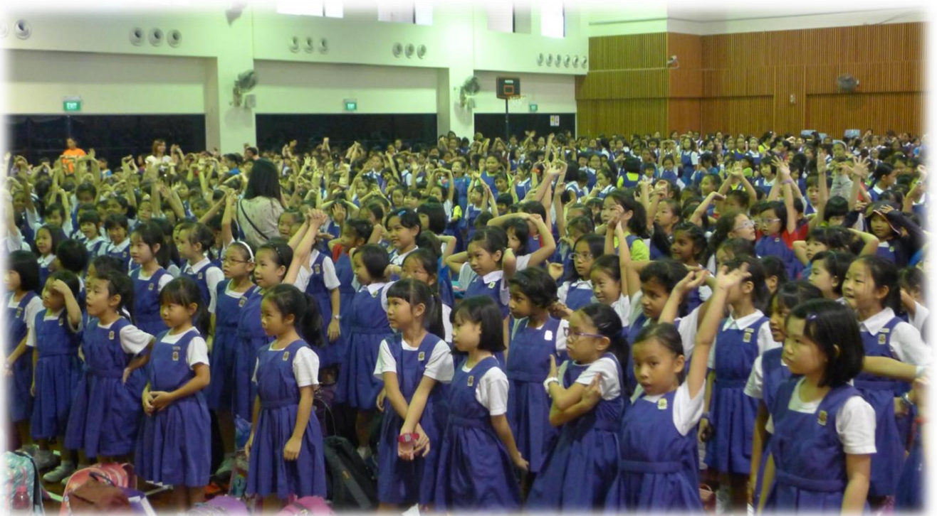
Our girls joining in the dance – Every Move I Make

I was a nervous wreck when the play started, monitoring that everything went as planned. But something made me take a step back. An inner voice was telling me to relax and to leave everything in God's hands. As I watched the play unfold from backstage, I started relaxing especially when the students "oooohh" and "ahhhh" when they recognised their teachers as they came on stage. It was such a joy to see them enjoying the play.