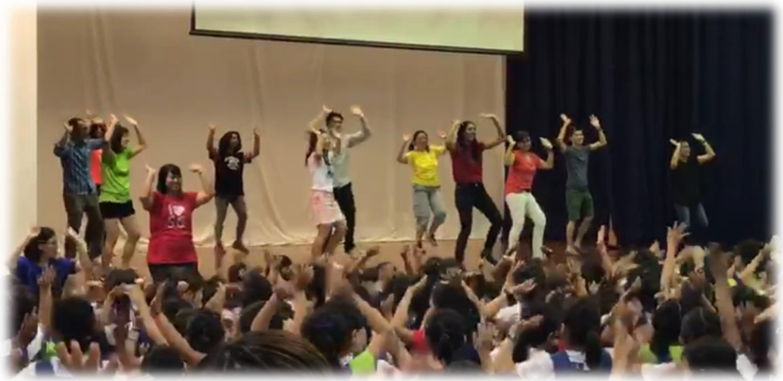
Teachers and PVs dancing for our Lord on Easter Monday

I have to add that the teachers involved in the play were very sporting. When told that they will be dancing in front of the students on stage, they gave the initial look as if to say "you must be kidding me". With some persuasion, they took to the dance like ducks taking to water.