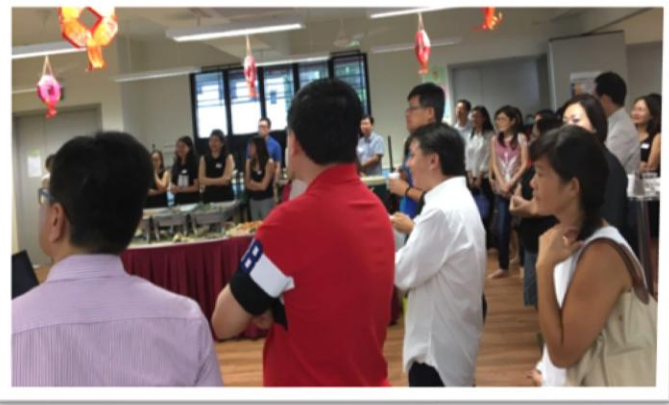
A presentation by the CPC introducing the new 2016 team and explaining what we do.