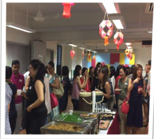
Our Parent Volunteers enjoying the breakfast refreshments.